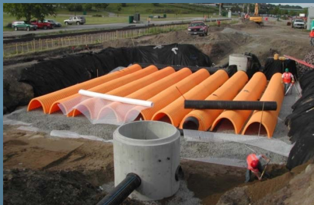
StormTech System, Bangor Waterfront, 2010