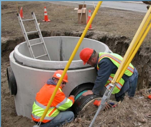
Spill containment, Fleet Maintenance, 2009