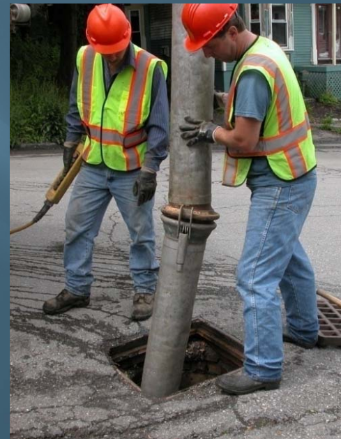
Catch basin cleaning crew, Bangor, 2009