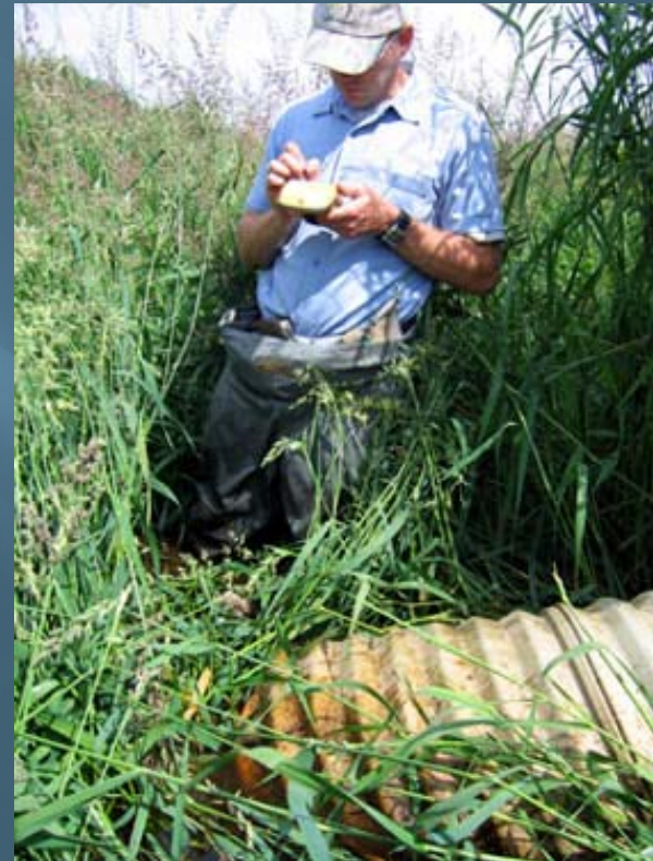
Dry weather outfall inspections, BASWG, 2008