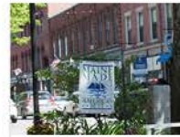
Business Partnership Initiative