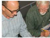
Planning Partnership Initiative