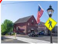
Village Partnership Initiative

While MaineDOT has traditionally worked to make sure "you can get there from here," the goal of our new Village Partnership Initiative is to make sure that once you get there, there is a place you want to be.