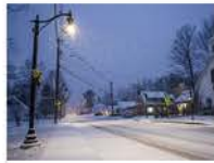
Municipal Partnership Initiative