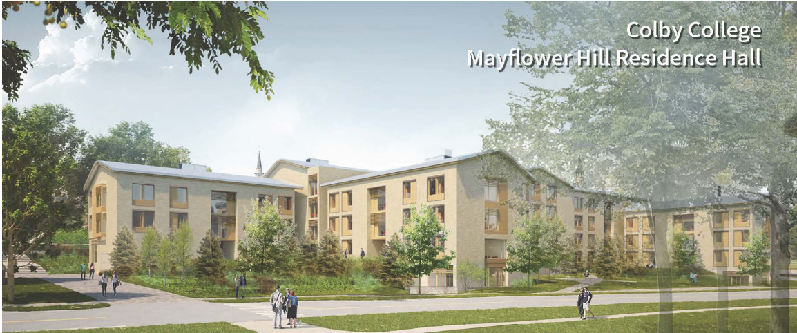
Colby College Mayflower Hill Residence Hall