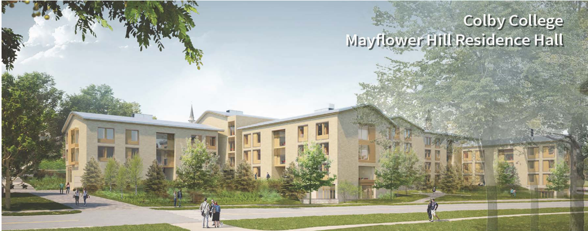
Colby College Mayflower Hill Residence Hall