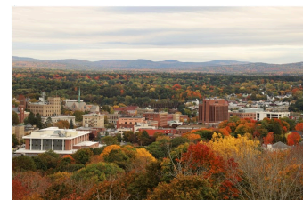
Nick Navarre Photo

This panel discussion will cover key trends in housing, construction, commercial real estate, and development, featuring insights from