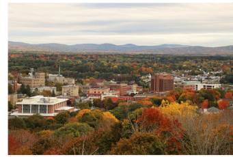
Nick Navarre Photo

City Perspective on Economic Development